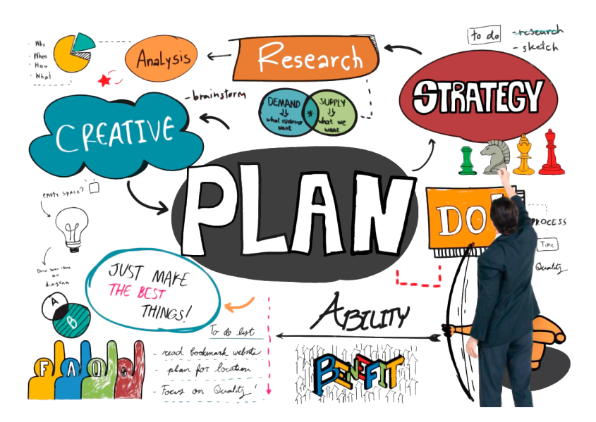
Figure 1.1: Example of figure.