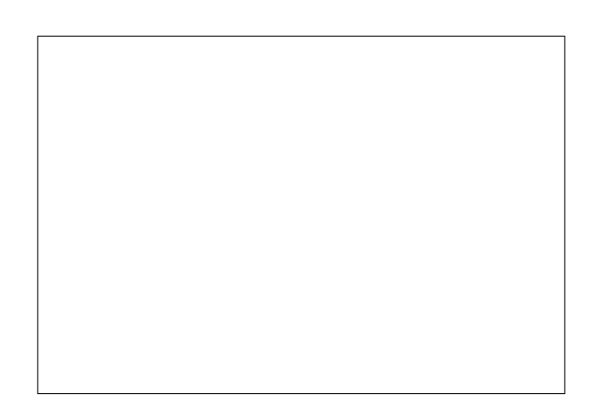
Figure 1. Example of caption. It is set in Roman so that mathematics (always set in Roman: B \sin A = A \sin B ) may be included without an ugly clash.

This is incorrect: "... subsequently developed by Alpher et\ al. [2] ..." because reference [2] has just two authors. If you use the \etal macro provided, then you need not worry about double periods when used at the end of a sentence as in Alpher et\ al.