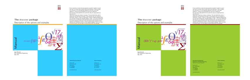
Figure 1: An example of the default settings and a customised cover

• \dtucoverTitleText[subtitle]{title}{type}{author}