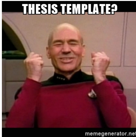
Figure 1.1: Glad to have a thesis class