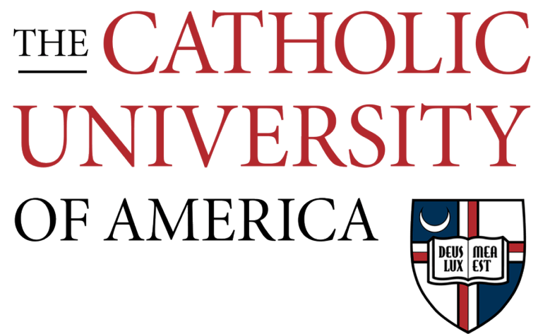
Figure 1.1: CUA Logo text at the captions